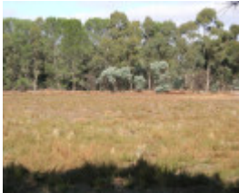
Dry Stone Wall C185