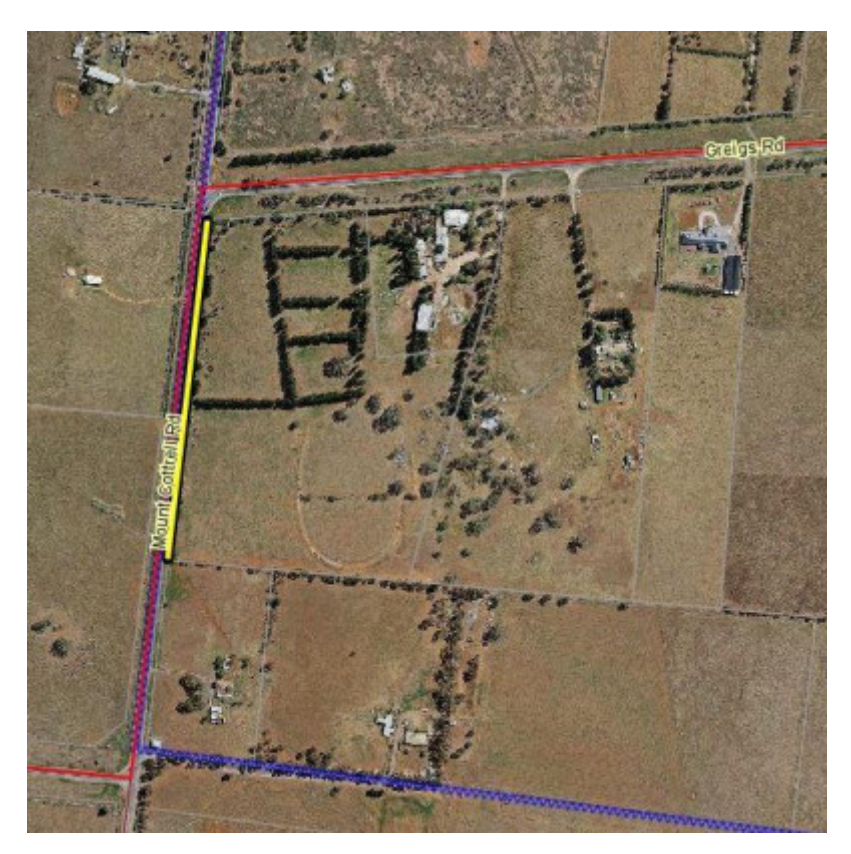
Dry Stone Wall C49