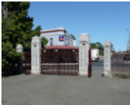
PRINCE'S PARK SOHE 2008