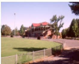
1 princes park park march2000 jh