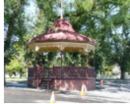
PRINCE'S PARK SOHE 2008