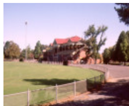
1 princes park park march2000 jh