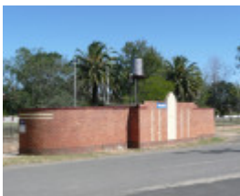
PRINCE'S PARK SOHE 2008