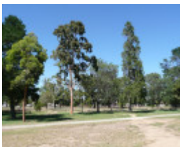
PRINCE'S PARK SOHE 2008