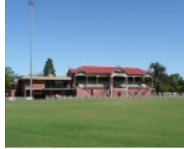
PRINCE'S PARK SOHE 2008