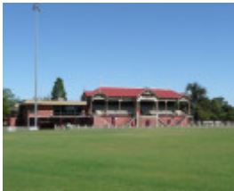
PRINCE'S PARK SOHE 2008