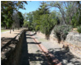
PRINCE'S PARK SOHE 2008