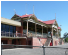
PRINCE'S PARK SOHE 2008