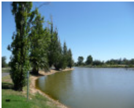
PRINCE'S PARK SOHE 2008