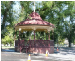
PRINCE'S PARK SOHE 2008