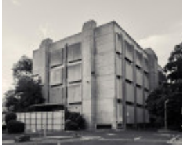
Fmr Psychiatric Hospital - Footscray.jpg