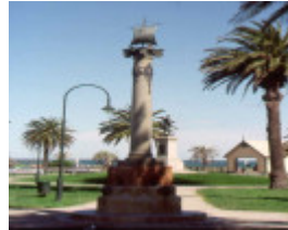
1 catani gardens st kilda sali cleve ac2 apr1999