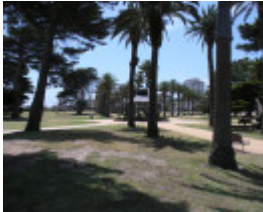
CATANI GARDENS SOHE 2008