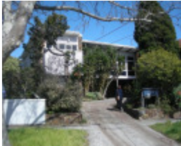
2017, front elevation.JPG