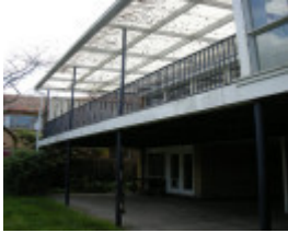
2017, rear deck a.JPG