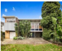
front elevation a.jpg