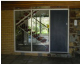
2017, main entrance door.JPG