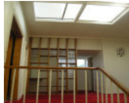
2017, upper level and skylight.JPG