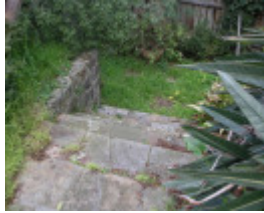
2017, rear garden.JPG