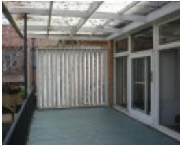
r2017, ear deck.JPG