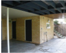
2017, below rear deck.JPG