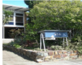
2017, front view with letterbox.JPG