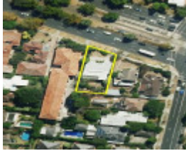
H2387 lind house air photo 16-01-2018.JPG