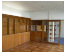
2017, living room.JPG