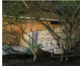
2017, main entrance.JPG