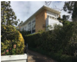
2017, east elevation.jpg