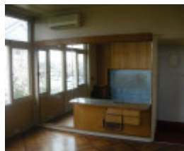
2017, main bedroom.JPG