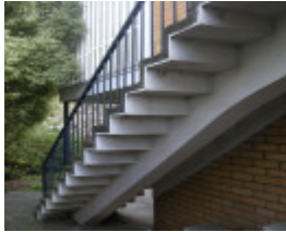
2017, rear stairs.JPG