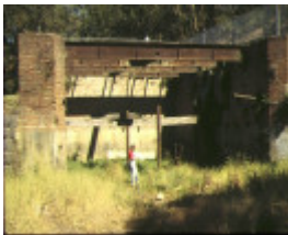
dights mill site dights falls abbotsford front view of mill dec1994