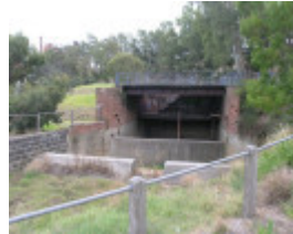
DIGHTS MILL SITE SOHE 2008