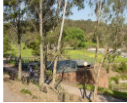
h01522 1 dights mill site dights falls yarra river abbotsford she project 2004