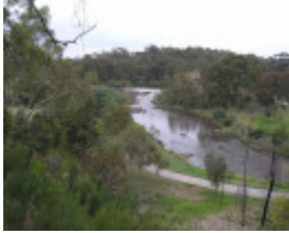
DIGHTS MILL SITE SOHE 2008