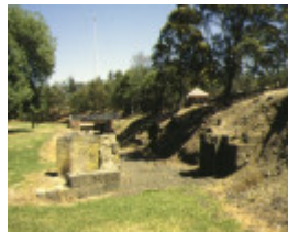
h01522 dights mill site dights falls abbotsford property view dec1994