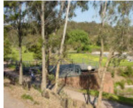
h01522 1 dights mill site dights falls yarra river abbotsford she project 2004