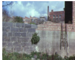
dights mill site dights falls abbotsford wall detail aug1979