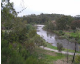
DIGHTS MILL SITE SOHE 2008