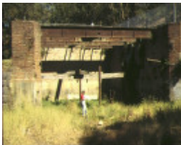
dights mill site dights falls abbotsford front view of mill dec1994