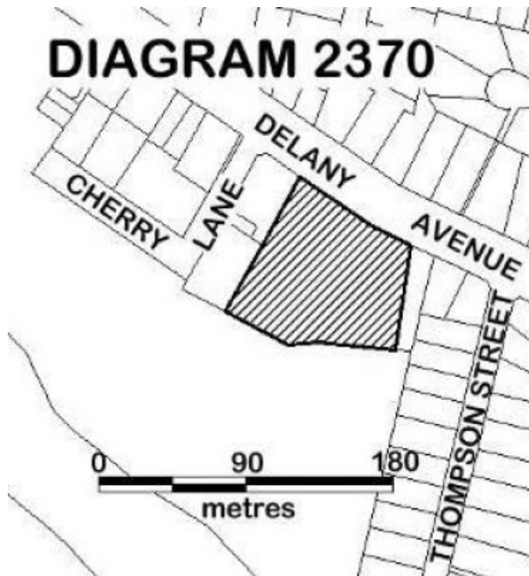
Bright Chinese Camp Extent Diagram 2370.jpg