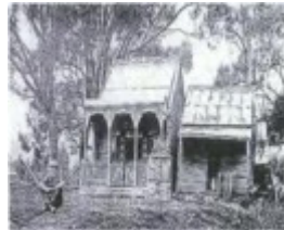
Joss House, undated.gif