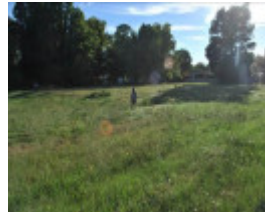
looking towards nth east corner 2017.jpg