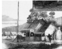
Chinese Joss House 1878 (Illustrated News).jpg