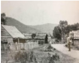
Bright Chinese Camp early 1900s.jpg