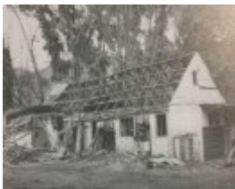
Quan Kee Hotel and Store c1970s.jpg