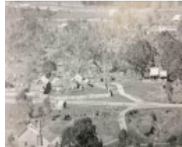
Bright Chinese Camp 1890.jpg