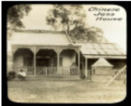
Joss House c1900s (SLV).jpg