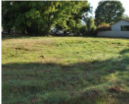
towards nth east corner 2017.jpg