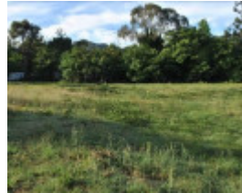
looking south 2017.jpg