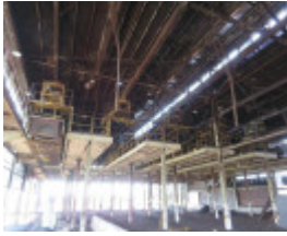
View from under the briquette loading station.