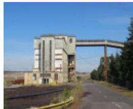
View south to the raw coal bunker and conveyor.