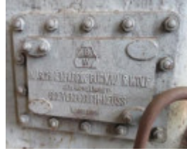
Briquetting machine at Morwell imported from Germany (2017).