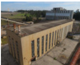
View southwest from the top of No.1 Briquette Factory looking at Wet Section No.1 building (foreground) with the raw coal bunker visible (background)