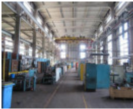
View inside the Mechanical Workshops, looking east.