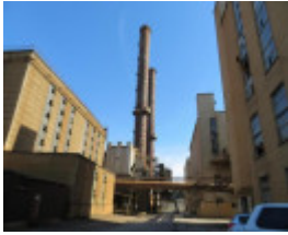
View looking west between Briquette Factories (right) and Power Station with chimneys 3 and 4 (left).