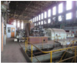
View inside the Turbine House, looking northeast.