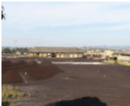
View east towards the briquette storage area, with the location of the former No.1 cooling tower in the middle, and the briquette storage shed in the background.