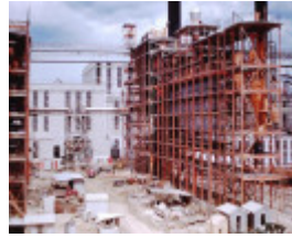
Construction of the Briquette Factories, undated.