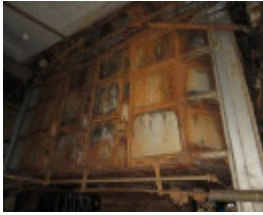
Brown coal fired boiler inside the Power Station.