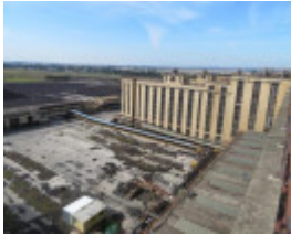
View northeast from the top of No.1 Briquette Factory looking at side of the Briquette Factory (right) and the collecting and feeding conveyors (left)