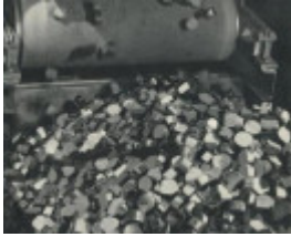
Loading briquettes for despatch, 1959.