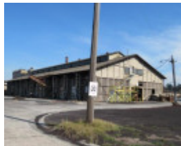
Briquette Storage Shed