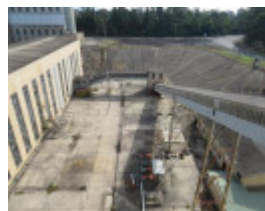
View east from the top of No.1 Briquette Factory looking at the conveyors and North West Corner Station.