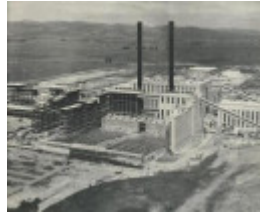
Morwell Briquette Works under construction, 1959.