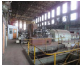
Wet Section Building