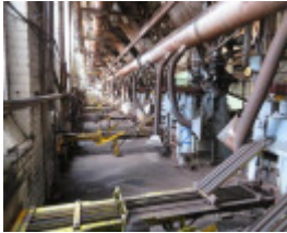
View of conveyors leading from briquette machines to external conveyor, looking east.