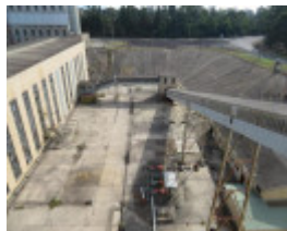
View east from the top of No.1 Briquette Factory looking at the conveyors and North West Corner Station.