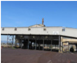
View south to briquette loading station.