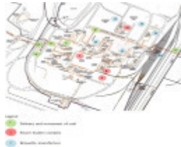
Site Map of Morwell Power Station Prepared 2017