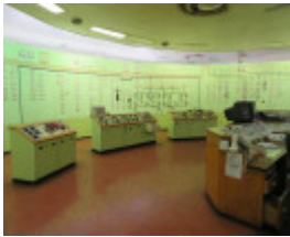
View inside the Power Station Control Room.