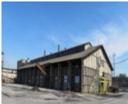
View southwest to Briquette Storage Shed.