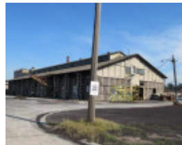
Briquette Storage Shed