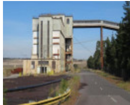
Raw Coal Bunker