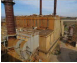
View south from the top of No.1 Briquette Factory looking at power station.