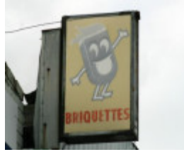
Bernie Briquette was an advertising character created by the SECV. These signs were once familiar throughout Victoria where briquettes were sold for domestic use.