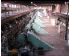
View of briquette machinery in No.1 Briquette Factory, looking east.