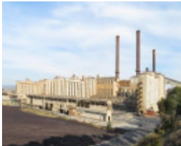
Morwell Power Station and Briquette Factories