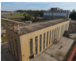
View southwest from the top of No.1 Briquette Factory looking at Wet Section No.1 building (foreground) with the raw coal bunker visible (background)