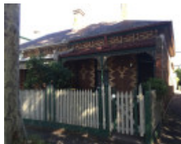
206-210 Barkly St Brunswick