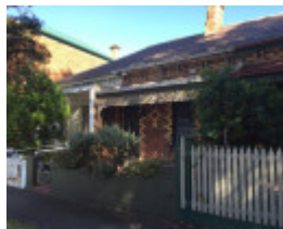
206-210 Barkly St Brunswick