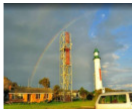
2010, Hume tower and white lighthouse.jpg