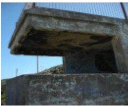
2018, World War II bunker on southern boundary.jpg