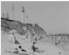
c.1960s from beach.jpg