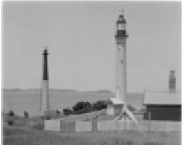
1920s_Obelisk and white lighthouse.jpg