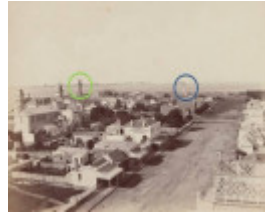
1890s view to Shortlands Bluff .jpg