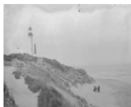
1920s looking east.jpg