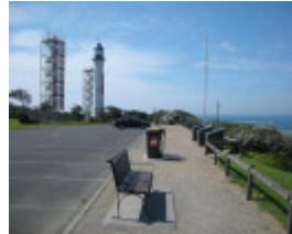
2018, Looking east _carpark.jpg