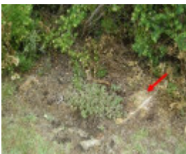
2018, Former location of the obelisk.jpg