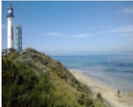
2018, Looking east .jpg