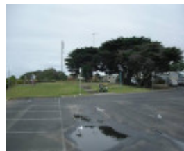
2018, Looking west to the bullring.jpg