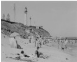
c.1960s from beach.jpg