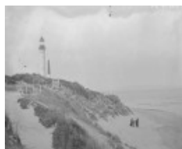
1920s looking east.jpg