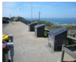
2018, Twentieth century memorials.jpg