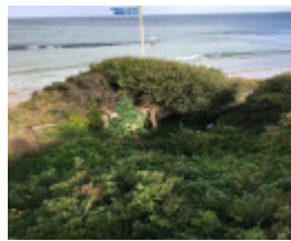
2018, Concealed see-saw searchlight bunker (1890s) on the southern boundary. .jpg