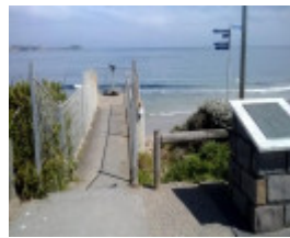
2018, Walkway to top of World War II bunker from carpark. .jpg