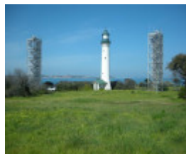
2018, Looking south-east_Murray tower on left_Hume Tower on right.jpg