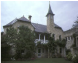
barragunda cape schanck road cape schanck rear view dec1984