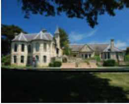
BARRAGUNDA SOHE 2008