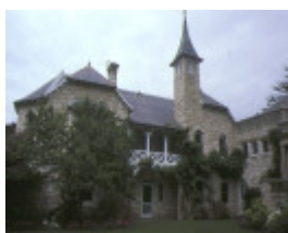
barragunda cape schanck road cape schanck rear view dec1984