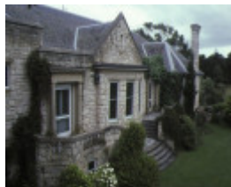
barragunda cape schanck road cape schanck new wing dec1984