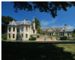
BARRAGUNDA SOHE 2008