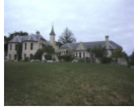
1 barragunda cape schanck road cape schanck view of property dec1984