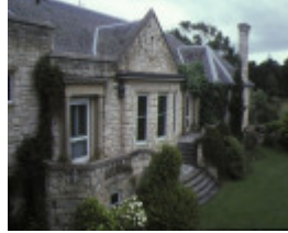
barragunda cape schanck road cape schanck new wing dec1984