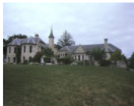
1 barragunda cape schanck road cape schanck view of property dec1984