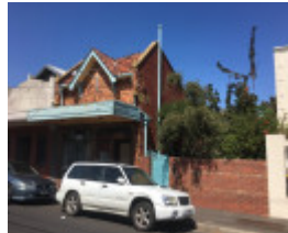
Morris Chemist - 153 Reynard Street