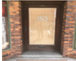
Morris Chemist - 153 Reynard Street