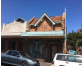
Morris Chemist - 153 Reynard Street