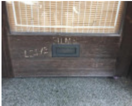
Morris Chemist - 153 Reynard Street