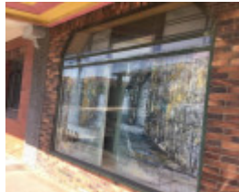
Morris Chemist - 153 Reynard Street