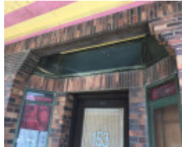
Morris Chemist - 153 Reynard Street