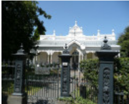
MIHARO SOHE 2008