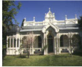
1 miharo noble street newtown front view sep1995