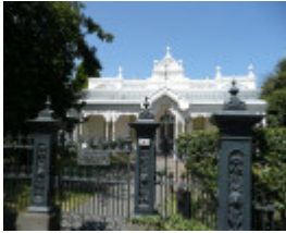
MIHARO SOHE 2008