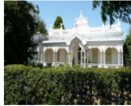
MIHARO SOHE 2008