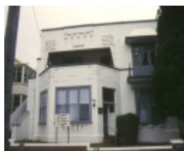
1 st leonards latrobe terrace newtown front view sep1995