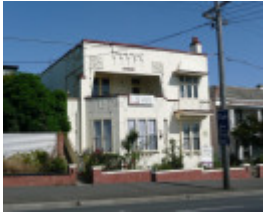
ST LEONARDS SOHE 2008