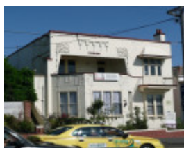
ST LEONARDS SOHE 2008