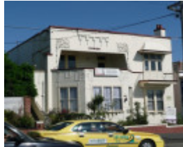
ST LEONARDS SOHE 2008