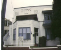
1 st leonards latrobe terrace newtown front view sep1995