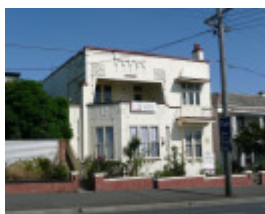
ST LEONARDS SOHE 2008