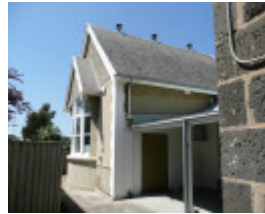
NOBLE STREET UNITING CHURCH, HALL AND KINDERGARTEN SOHE 2008