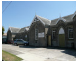
NOBLE STREET UNITING CHURCH, HALL AND KINDERGARTEN SOHE 2008