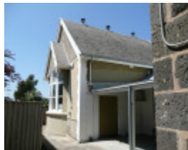
NOBLE STREET UNITING CHURCH, HALL AND KINDERGARTEN SOHE 2008