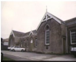
1 noble street uniting church hall & kindergarten noble street newtown kindergarten