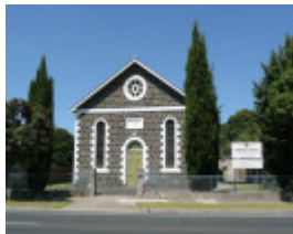
NOBLE STREET UNITING CHURCH, HALL AND KINDERGARTEN SOHE 2008