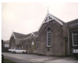
1 noble street uniting church hall & kindergarten noble street newtown kindergarten