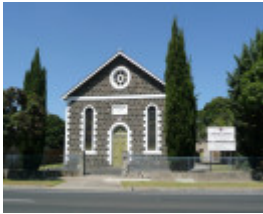
NOBLE STREET UNITING CHURCH, HALL AND KINDERGARTEN SOHE 2008