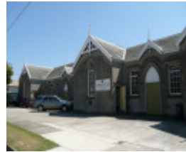
NOBLE STREET UNITING CHURCH, HALL AND KINDERGARTEN SOHE 2008