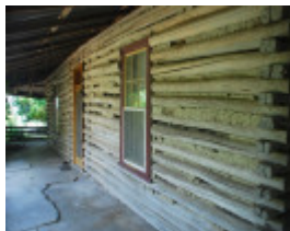
NOTCHED LOG COTTAGE SOHE 2008