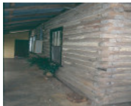
H01987 log cottage poowong east side 2001