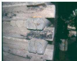
H01987 log cottage poowong corner detail 2001