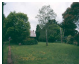
H01987 log cottage poowong hilltop position 2001