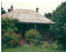
H01987 log cottage poowong front 2001