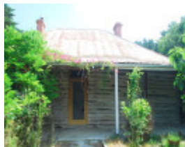
NOTCHED LOG COTTAGE SOHE 2008