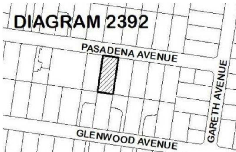
Extent of Registration