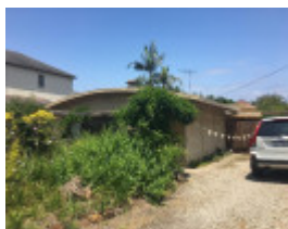
Grant House 2018.jpg