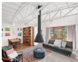
Grant house living and dining looking west.jpg