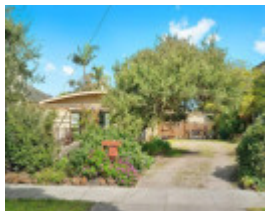
Grant House Front Dec 2018.jpg