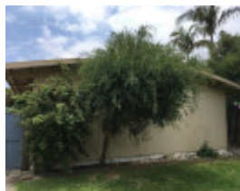
Grant House Rear Dec 2018.jpg