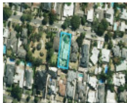
Grant House Aerial Dec 2018.jpg