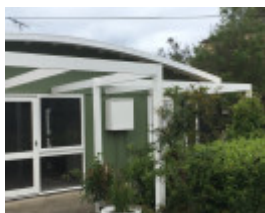
North courtyard towards entry