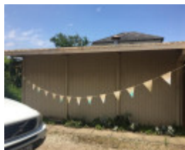
Grant House 2018, West facing elevation (rear module).jpg