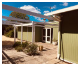
West courtyard looking north east