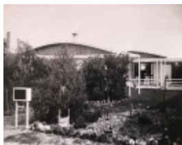
Grant House c1960s SLV Photo.jpg