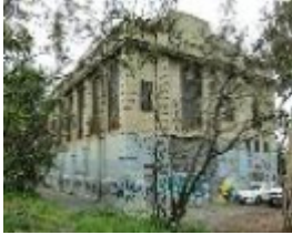
Myrtle Road Warburton Road, 26A & 2B EAST CAMBERWELL SUBSTATION