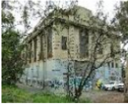
Myrtle Road Warburton Road, 26A & 2B EAST CAMBERWELL SUBSTATION