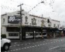
CANTERBURY ROAD COMMERCIAL PRECINCT east