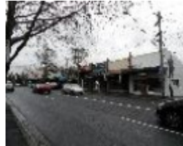
CANTERBURY ROAD COMMERCIAL PRECINCT west