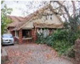
9 Christowel Street.jpg