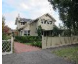
2 Stodard Street.jpg