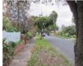
CAMBERWELL LINKS ESTATE PRECINCT street