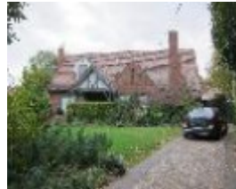
14 Stodart Street.jpg