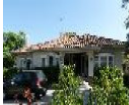
460 Camberwell Road.jpg