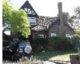
458 Camberwell Road.jpg