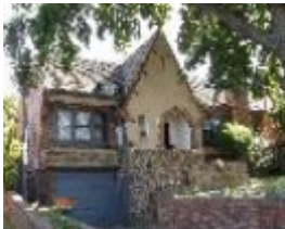
470 Camberwell Road.jpg