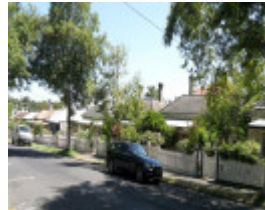
ST JOHN'S WOOD AND SAGE'S Paddock PRECINCT street.jpg