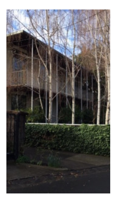
Brett House exterior.jpg