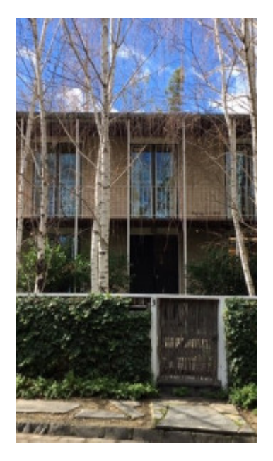
Brett House exterior.jpg