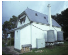
former primary school no668 cardigan rear view aug1984