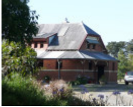
FORMER PRIMARY SCHOOL NO. 668 SOHE 2008