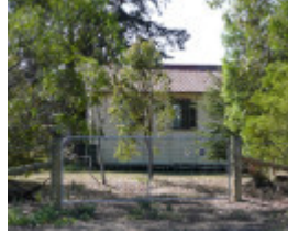
FORMER PRIMARY SCHOOL NO. 668 SOHE 2008