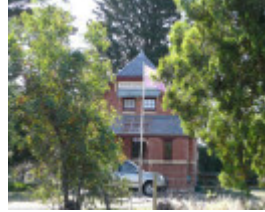
FORMER PRIMARY SCHOOL NO. 668 SOHE 2008