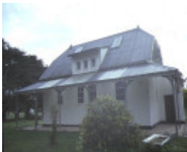
1 former primary school no688 cardigan front view aug1984