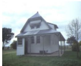
former primary school no668 cardigan side view entrance aug1984