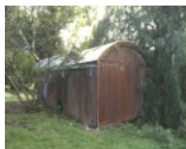
1 prefabricated iron cottage mt duneed road mt duneed front view jun1995