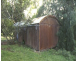
1 prefabricated iron cottage mt duneed road mt duneed front view jun1995