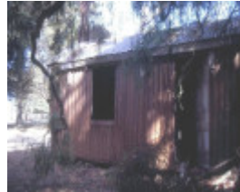
h01131 prefabricated iron cottage mt duneed rd mount duneed front left aspect she project 2003