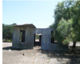
PREFABRICATED IRON COTTAGE SOHE 2008