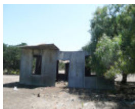
PREFABRICATED IRON COTTAGE SOHE 2008