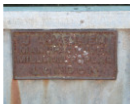
PREFABRICATED IRON COTTAGE SOHE 2008