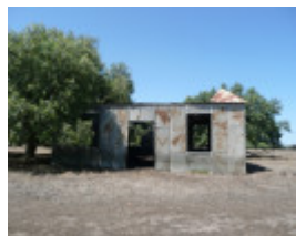
PREFABRICATED IRON COTTAGE SOHE 2008