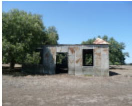
PREFABRICATED IRON COTTAGE SOHE 2008