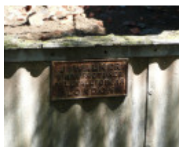
PREFABRICATED IRON COTTAGE SOHE 2008