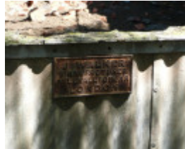
PREFABRICATED IRON COTTAGE SOHE 2008