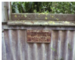
1 prefabricated iron cottage inverleigh detail of manufacturers label