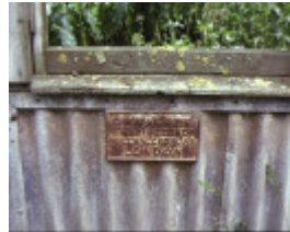
1 prefabricated iron cottage inverleigh detail of manufacturers label