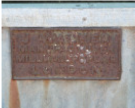
PREFABRICATED IRON COTTAGE SOHE 2008