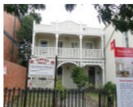
EUDOXUS SOHE 2008