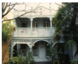
1 eudoxus gelong front view jul1995