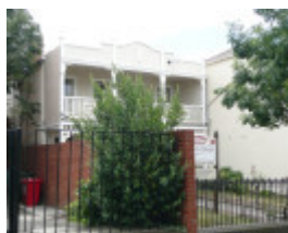
EUDOXUS SOHE 2008