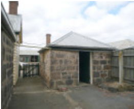
MOUNT HESSE STATION SOHE 2008