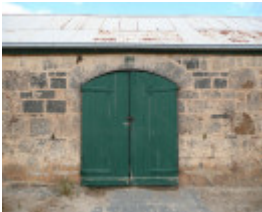
MOUNT HESSE STATION SOHE 2008