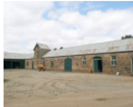
MOUNT HESSE STATION SOHE 2008