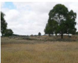
MOUNT HESSE STATION SOHE 2008