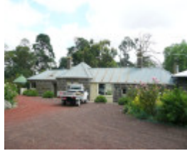
MOUNT HESSE STATION SOHE 2008