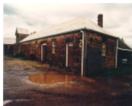
1 mount hesse homestead mount hesse estate road winchelsea stables