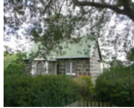
MOUNT HESSE STATION SOHE 2008