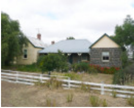
MOUNT HESSE STATION SOHE 2008