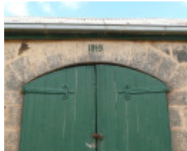
MOUNT HESSE STATION SOHE 2008