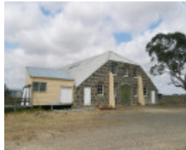
MOUNT HESSE STATION SOHE 2008