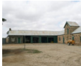
MOUNT HESSE STATION SOHE 2008