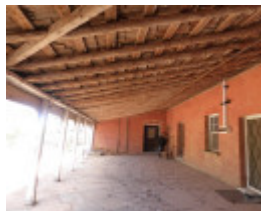
verandah of 1854 addition Sept 2015.JPG