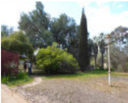
garden to east of homestead Sept 2015.JPG