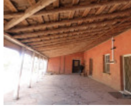
verandah of 1854 addition Sept 2015.JPG