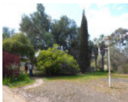
garden to east of homestead Sept 2015.JPG