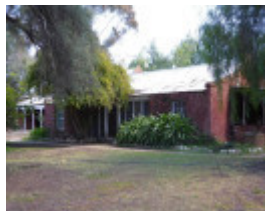
original 1846 homestead Sept 2015.JPG