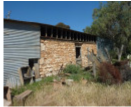
limestone wall in shed Sept 2015.JPG