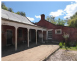
1854 addition with 1846 homestead in background Sept 2015.JPG