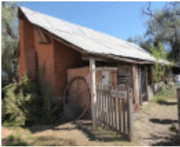
Store & cellar building Sept 2015.JPG