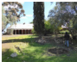
homestead from east Sept 2015.JPG