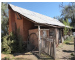
Store & cellar building Sept 2015.JPG