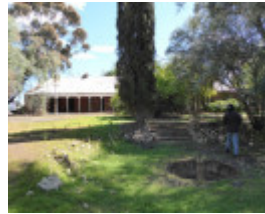
homestead from east Sept 2015.JPG