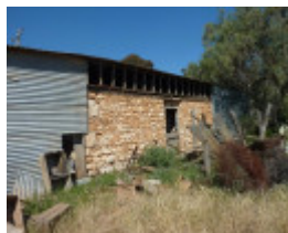
limestone wall in shed Sept 2015.JPG