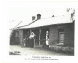
1879 image of 1846 homestead.jpg