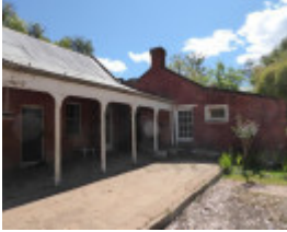
1854 addition with 1846 homestead in background Sept 2015.JPG