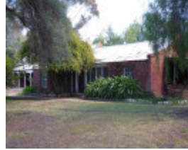
original 1846 homestead Sept 2015.JPG