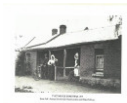
1879 image of 1846 homestead.jpg