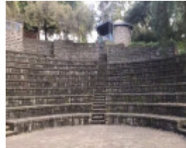
Amphitheatre with Kiosk