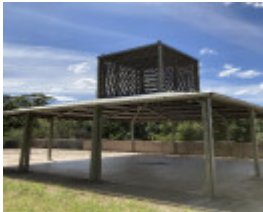
Gazebo Upper Level of Concrete Pavilion