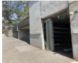
Lower Level Pavilion