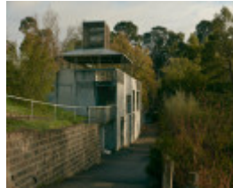
Fairfield Amphitheatre Concrete Pavilion