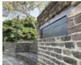
Amphitheatre Light and Film Hatch