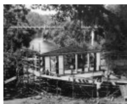
1983 Temporary scaffolded theatre for Epidavros Festival