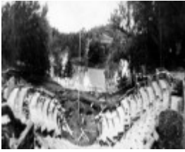
1985 Fairfield Amphitheatre during construction