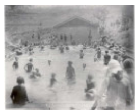
1925 Swimming Pool at Fairfield Yarra River