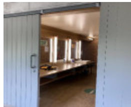
Change Rooms Pavilion