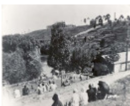
1920s Swimming Pool at Fairfield Yarra River