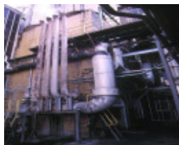
h01311 colonial sugar refinery whitehall street yarraville boiler house