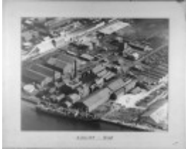
h01311 csr whitehall street yarraville august 1949