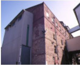
h01311 colonial sugar refinery whitehall street yarraville retail packing house