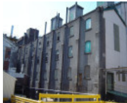
h01311 csr whitehall street yarraville north char ende 12 04 mz