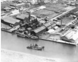
h01311 csr whitehall street yarraville december 1939