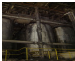
h01311 csr whitehall street yarraville interior south char end 02 12 04 mz