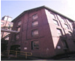
h01311 colonial sugar refinery whitehall street yarraville melting house