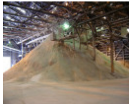
h01311 csr whitehall street yarraville interior bulk sugar store 12 04 mz