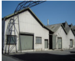
h01311 csr whitehall street yarraville engineers workshops 12 04 mz