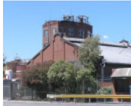
CSR COMPLEX SOHE 2008