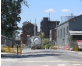
CSR COMPLEX SOHE 2008