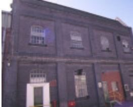
Colonial Sugar Refinery Whitehall Street Yarraville Store