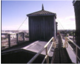
h01311 colonial sugar refinery whitehall street yarraville char tower