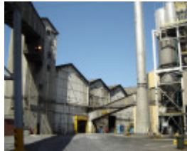
h01311 csr whitehall street yarraville bulk sugar store 12 04 mz