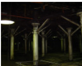
h01311 csr whitehall street yarraville interior south char end 01 12 04 mz