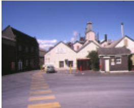
Colonial Sugar Refinery Whitehall Street Yarraville View from West