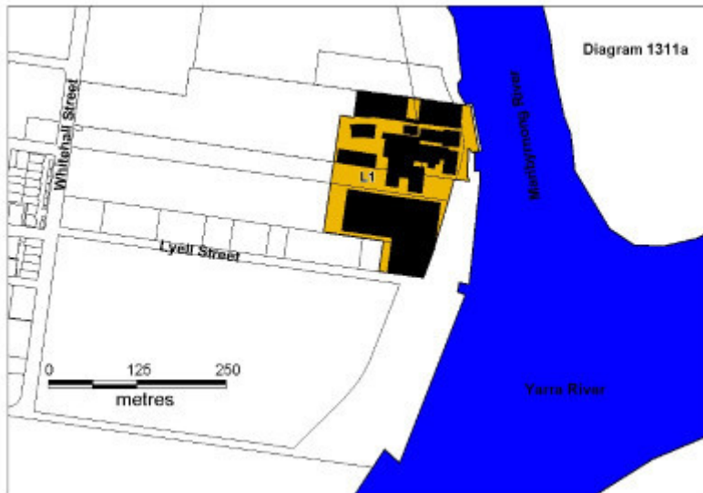
h01311 csr yarraville plan a mz april2005