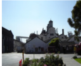
h01311 1 csr yarraville veiw from west 12 04 mz