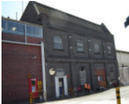
h01311 csr whitehall street yarraville bag store 12 04 mz