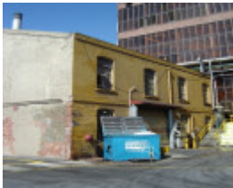
h01311 csr whitehall street yarraville golden syrup and treacle packing store 12 04 mz