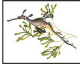
State Marine Animal Common Seadragon