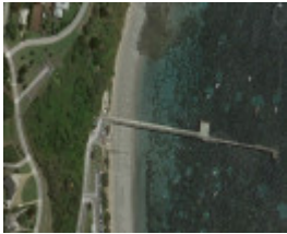
Flinders Pier from above 2018