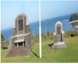
WWI and WW2 memorials