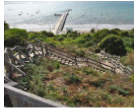
Path from reserve to foreshore