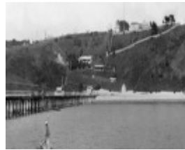
Pier staff quarters cable station 1890 1910