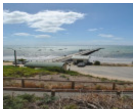
Flinders pier 2022