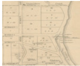
Extract tourist map 1914