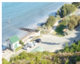
Pier boat ramp from above