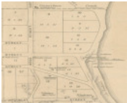
Extract tourist map 1914