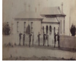
First cable station and PO