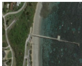
Flinders Pier from above 2018