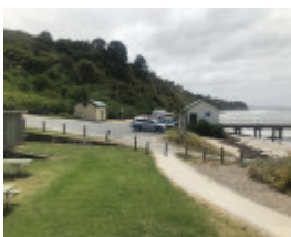
Entrance to pier and shed