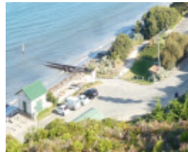
Pier boat ramp from above