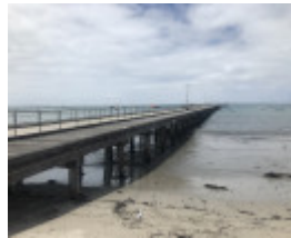
South side pier