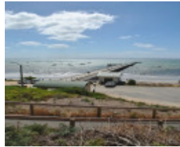
Flinders pier 2022