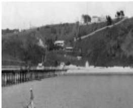
Pier staff quarters cable station 1890 1910