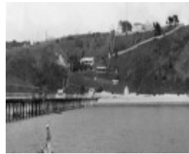
Pier staff quarters cable station 1890 1910