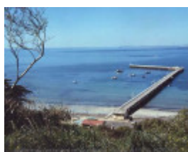
Flinders Jetty 1971