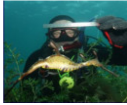
Citizen science Seadragon