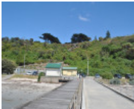
Cable landing site 2