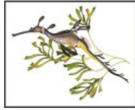
State Marine Animal Common Seadragon