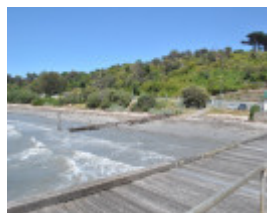
Cable landing site