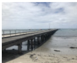
South side pier