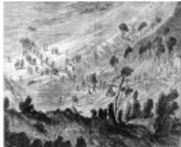
Extract SLV 1869