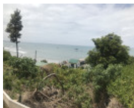
Pier from path