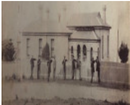
First cable station and PO