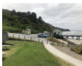
Entrance to pier and shed