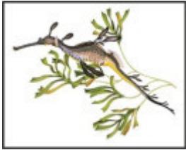
State Marine Animal Common Seadragon