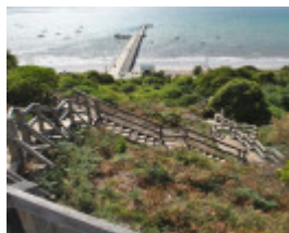
Path from reserve to foreshore