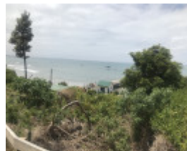
Pier from path