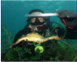
Citizen science Seadragon