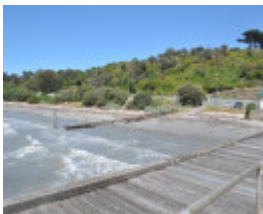
Cable landing site