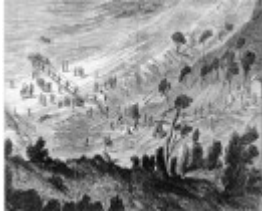
Extract SLV 1869