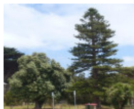
Norfolk Island Hibiscus Norfolk Island Pine and Cordyline