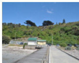
Cable landing site 2