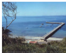
Flinders Jetty 1971