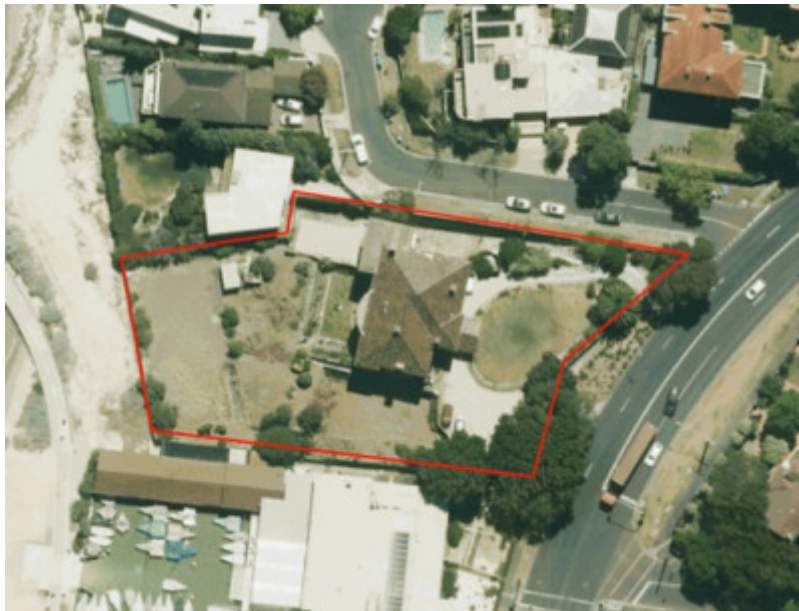
Extent - aerial