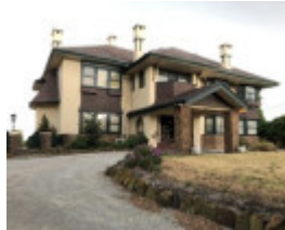
2022 Kuring-gai 2