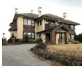
2022 Kuring-gai 2