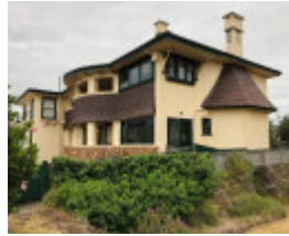
2022 Kuring-gai south and west elevations