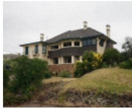
2022 Kuring-gai view from the south west