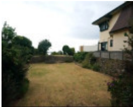
2022 Kuring-gai southern elevation and sunken garden