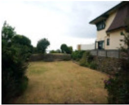
2022 Kuring-gai southern elevation and sunken garden