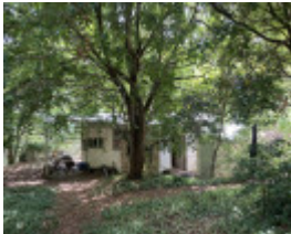
Edith Ingpen House View from Road Entrance