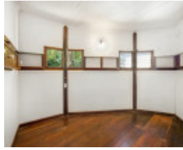
Interior Room 2023