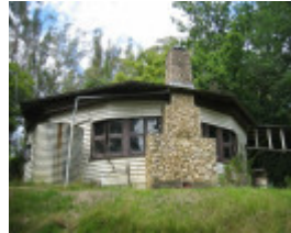
Edith Ingpen House north side