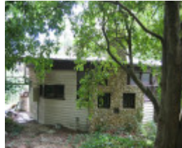
Edith Ingpen House south-east side