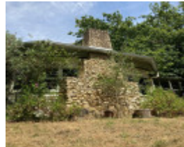
Ed House 2022