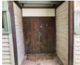
Edith Ingpen House Front Door