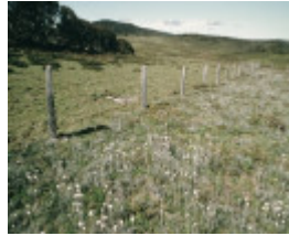
Pretty Valley Fenced vs Unfenced 1992