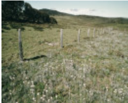
Pretty Valley Fenced vs Unfenced 1992