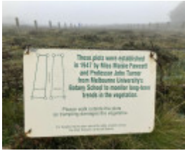
Pretty Valley Fenced Plot Sign 2022