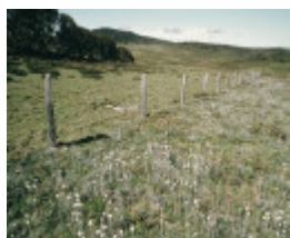
Pretty Valley Fenced vs Unfenced 1992