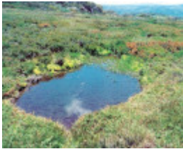
Rocky Valley peatland within the fenced plot 1982