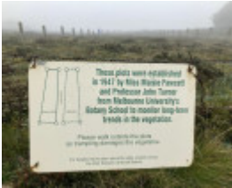
Pretty Valley Fenced Plot Sign 2022