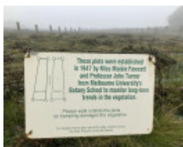
Pretty Valley Fenced Plot Sign 2022