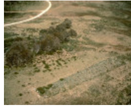
Aerial view Pretty Valley 1992