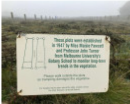
Pretty Valley Fenced Plot Sign 2022