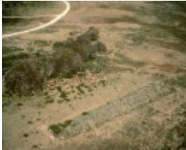
Aerial view Pretty Valley 1992