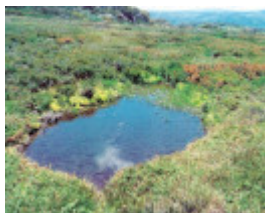
Rocky Valley peatland within the fenced plot 1982