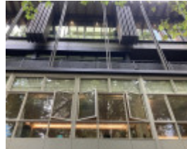
View looking upwards from Ridgway Place