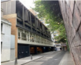
View of the Lyceum Club from Ridgway Place