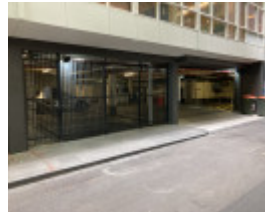
Lyceum Club Car Park Entry