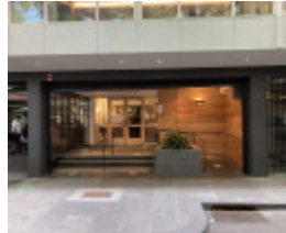
Lyceum Club Main Entry