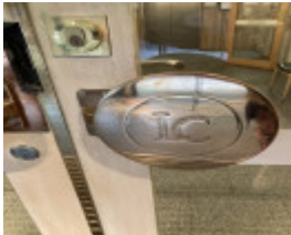
Lyceum Club Door Front Handle