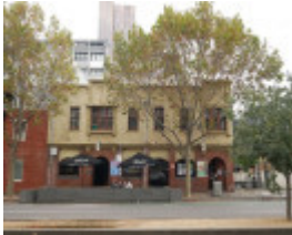
2022 east elevation