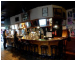
2022 ground floor bar