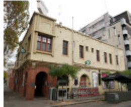
2022 north elevation