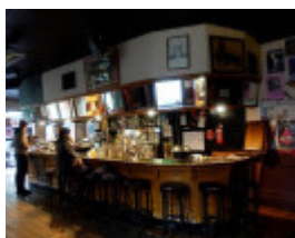
2022 ground floor bar