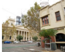
2022 view to trades hall