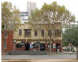
2022 east elevation