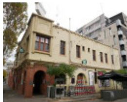
2022 north elevation