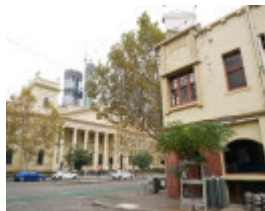
2022 view to trades hall