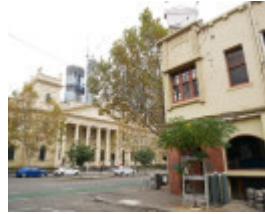
2022 view to trades hall