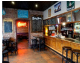
2022 ground floor bar looking to dining room