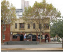
2022 east elevation