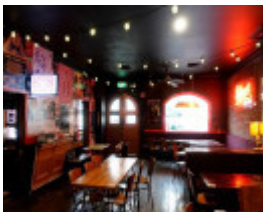
2022 ground floor dining room