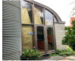
AS Front Door 2022