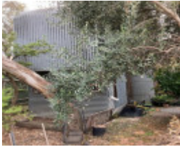
AS May 2022