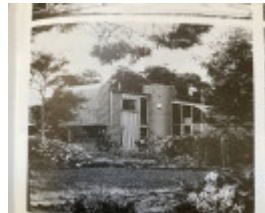
AS c 1980s