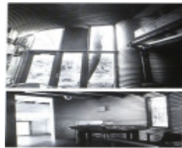
Actor's Studio House - Living Room and Kitchen 1980s