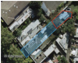
AS Aerial Photo of Extent 2022