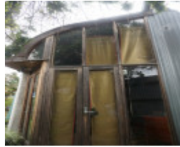
AS 2022 Back Door