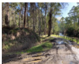
View to North