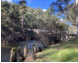
The Crossing 2022