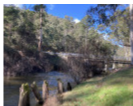
The Crossing 2022