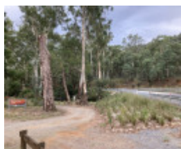
View to the east