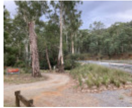
View to the east