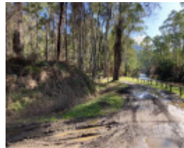
View to North