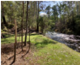
View to NE