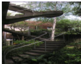
1 cairo flats nicholson street fitzroy exterior staircase oct1993