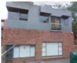
14 HANOVER STREET.jpg