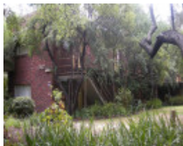
CAIRO FLATS SOHE 2008