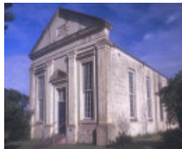
h00850 former st andrews presbyterian church and manse william st port fairy overall view she project 2003