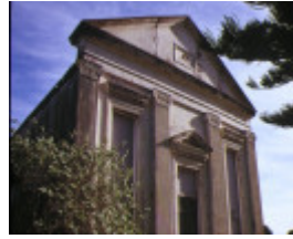
Former St Andrews Presbyterian Church & Manse William Street Port Fairy Front Elevation of Church June 1989