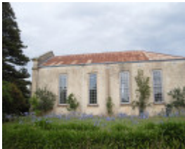
FORMER ST ANDREWS PRESBYTERIAN CHURCH AND MANSE SOHE 2008