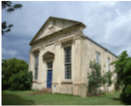
FORMER ST ANDREWS PRESBYTERIAN CHURCH AND MANSE SOHE 2008