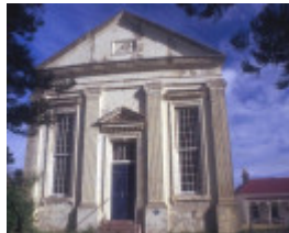
h00850 1 former st andrews presbyterian church and manse william st port fairy front facade she project 2003