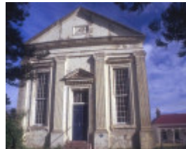
h00850 1 former st andrews presbyterian church and manse william st port fairy front facade she project 2003