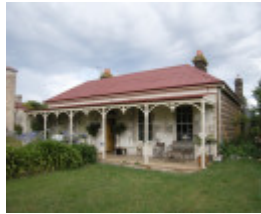
FORMER ST ANDREWS PRESBYTERIAN CHURCH AND MANSE SOHE 2008