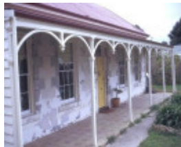
h00850 former st andrews presbyterian church and manse william st port fairy manse front verandah she project 2003