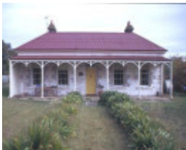
h00850 former st andrews presbyterian church and manse william st port fairy front of manse she project 2003