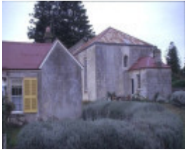
h00850 former st andrews presbyterian church and manse william st port fairy rear of manse and church she project 2003