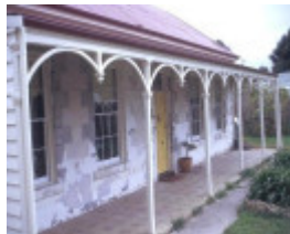
h00850 former st andrews presbyterian church and manse william st port fairy manse front verandah she project 2003