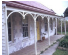
h00850 former st andrews presbyterian church and manse william st port fairy manse front verandah she project 2003