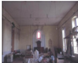
h00850 former st andrews presbyterian church and manse william st port fairy church interior she project 2003