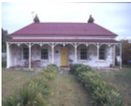
h00850 former st andrews presbyterian church and manse william st port fairy front of manse she project 2003