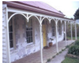
h00850 former st andrews presbyterian church and manse william st port fairy manse front verandah she project 2003