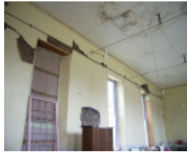
FORMER ST ANDREWS PRESBYTERIAN CHURCH AND MANSE SOHE 2008