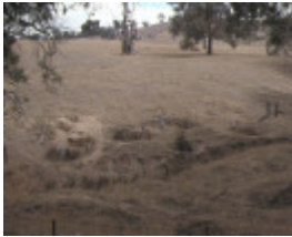
1 hard hill mining site garden gully road stawell landscape mar1990