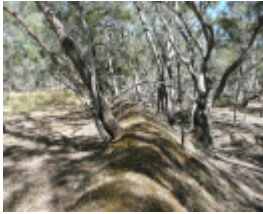
HARD HILL MINING SITE SOHE 2008