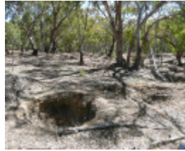
HARD HILL MINING SITE SOHE 2008