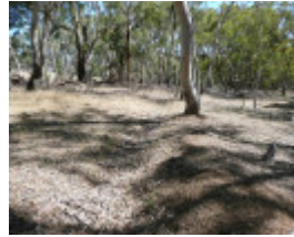
HARD HILL MINING SITE SOHE 2008