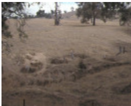
1 hard hill mining site garden gully road stawell landscape mar1990