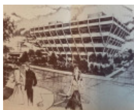
Undated artist's impression of the building