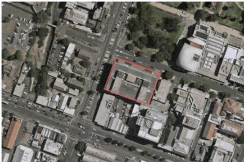
2023 aerial diagram extent of registration