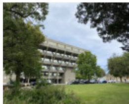
2023 - viewed from Johnstone Park