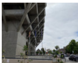
2023 - plaza on Little Malop Street