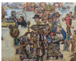
2023 - mural detail