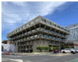
2023 - north and east elevations