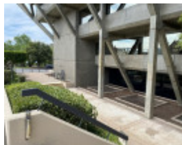
2023 The building is stepped down from Fenwick Street creating a small plaza below