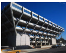
1979 State Government Offices viewed from Little Malop Street