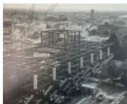
August 1977 the State Government Offices under construction