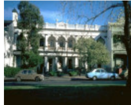
LOTHIAN BUILDINGS SOHE lothian buildings 2008