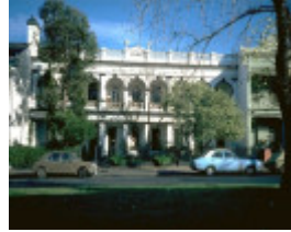
LOTHIAN BUILDINGS SOHE lothian buildings 2008