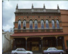
h00043 313 drummond street carlton exterior view