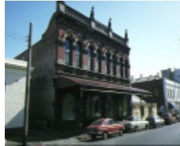
h00043 1 315 drummond street carlton exterior view