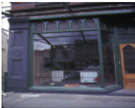
h00043 315 drummond street carlton exterior window