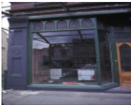
h00043 315 drummond street carlton exterior window