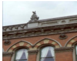
h00043 313 drummond street carlton exterior detail