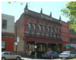
BUILDING SOHE 2008