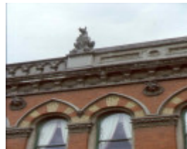
h00043 313 drummond street carlton exterior detail