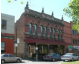
BUILDING SOHE 2008