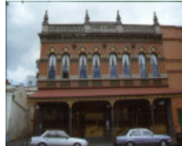
h00043 313 drummond street carlton exterior view