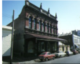
h00043 1 315 drummond street carlton exterior view