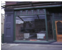
h00043 315 drummond street carlton exterior window