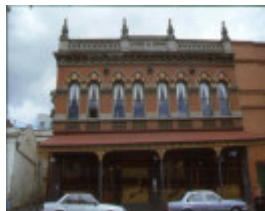
h00043 313 drummond street carlton exterior view