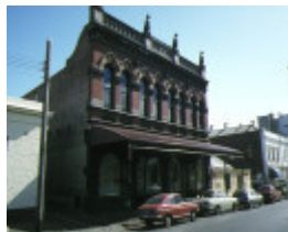
h00043 1 315 drummond street carlton exterior view