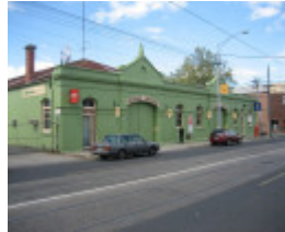
Northcote Tramways Building Thornbury Oct 2007 mz High Street Elevation