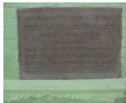
Northcote Tramways Building Thornbury May 2009 mz Foundation Stone