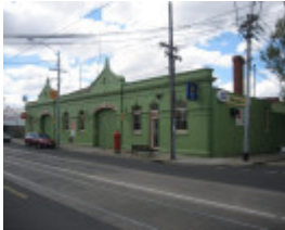
Northcote Tramways Building Thornbury Oct 2007 mz Front Elevation 01