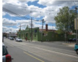
Northcote Tramways Building Thornbury Oct 2007 mz High Street & Martin Street Elevations