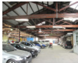
Northcote Tramways Building Thornbury May 2009 mz Car Shed Interior