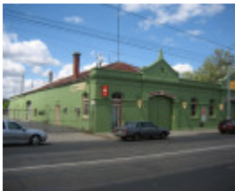
Northcote Tramways Building Thornbury Oct 2007 mz Front 7 North Elevations