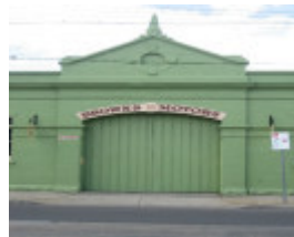
Northcote Tramways Building Thornbury Oct 2007 mz Car Shed Entry