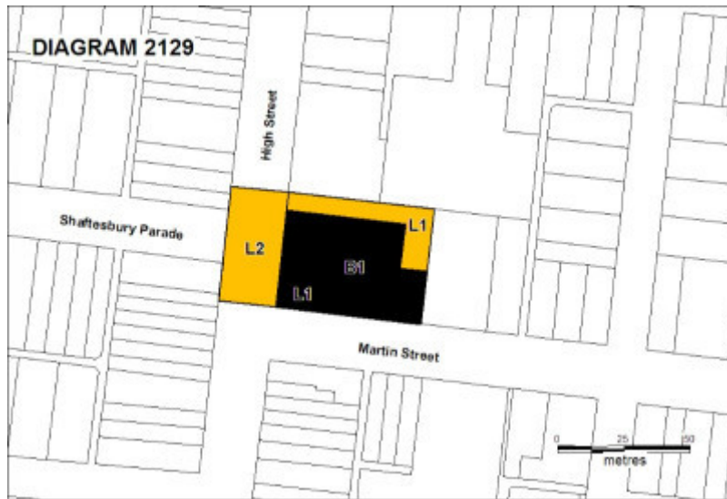
Northcote Cable Tram Building Plan June 2009