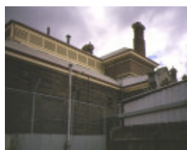
police station drummond street carlton lock up & watchhouse 1997