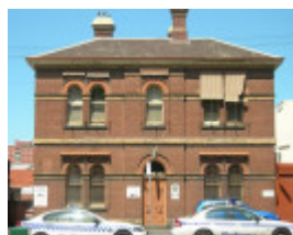
POLICE STATION SOHE 2008