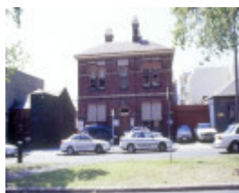
h01543 police station drummond street carlton front