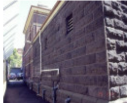
h01543 police station drummond street carlton side building b