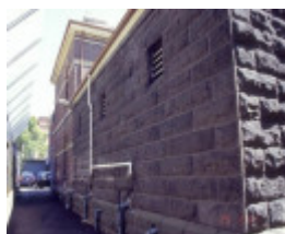
h01543 police station drummond street carlton side building b