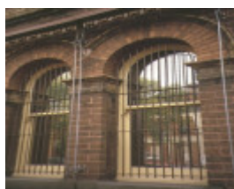
police station drummond street carlton detail of windows