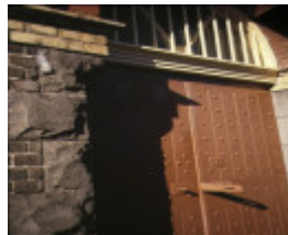
police station drummond street carlton detail of door