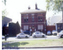
h01543 police station drummond street carlton front