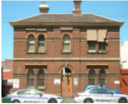
POLICE STATION SOHE 2008