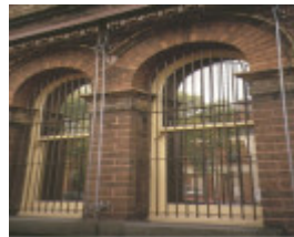
police station drummond street carlton detail of windows