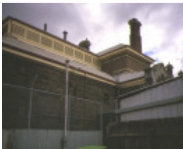
police station drummond street carlton lock up & watchhouse 1997