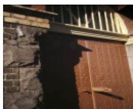
police station drummond street carlton detail of lockup door