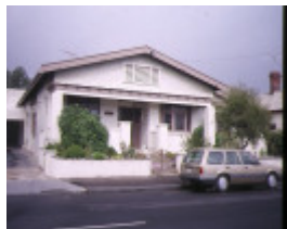
1 residence 9 gertrude street geelong front view sep1995