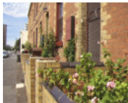
cambridge terrace drummond street carlton north entrance dec1998