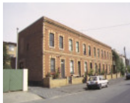
1 cambridge terrace drummond street carlton north front view dec1998