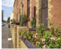
cambridge terrace drummond street carlton north entrance dec1998