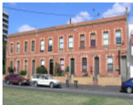
CAMBRIDGE TERRACE SOHE 2008