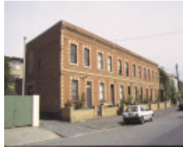
1 cambridge terrace drummond street carlton north front view dec1998