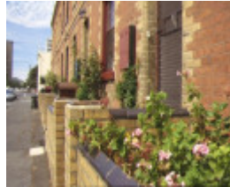
cambridge terrace drummond street carlton north entrance dec1998