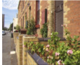
cambridge terrace drummond street carlton north entrance dec1998