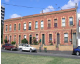
CAMBRIDGE TERRACE SOHE 2008