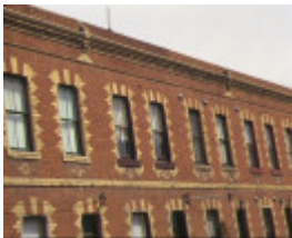
cambridge terrace drummond street carlton north facade detail dec1998